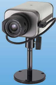
► Auto Iris Lens