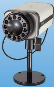
► IR Lens