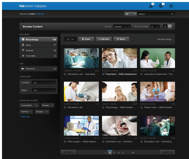
Calypso Content Browser