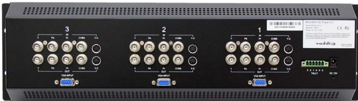
Figure 2: Back panel of PreVIEW HD Triple 5.0, showing the input, output, tally and power connections