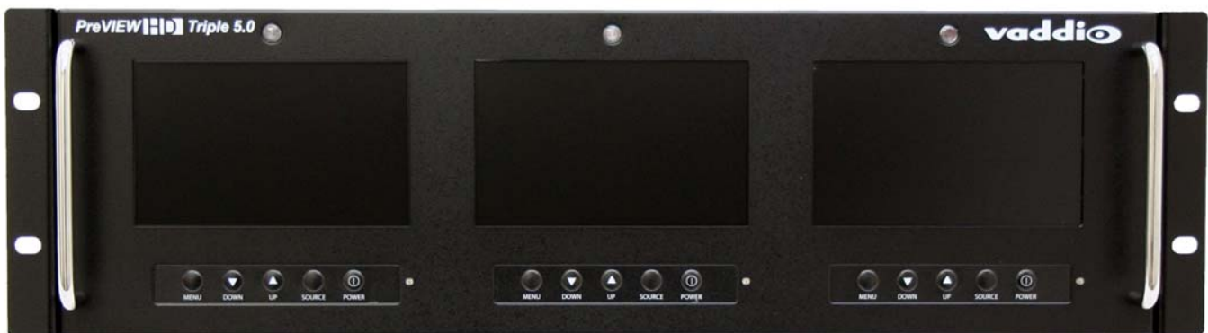
Figure 3: Front panel of PreVIEW HD Triple 5.0 LCD monitors