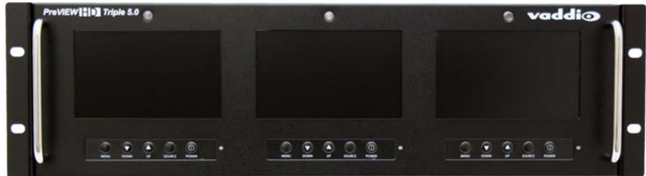
Figure 1: Front panel of PreVIEW HD Triple 5.0 LCD monitors

The PreVIEW HD Triple 5.0 is part of Vaddio's new line of HD LCD monitors. With three 5.0" LCD monitors, these PreVIEW HD monitors provide cleaner, sharper video images. The native widescreen LCDs now have an internal menu to adjust the settings (brightness, contrast, color, etc.) of each monitor. In addition, there is also an overscan option.